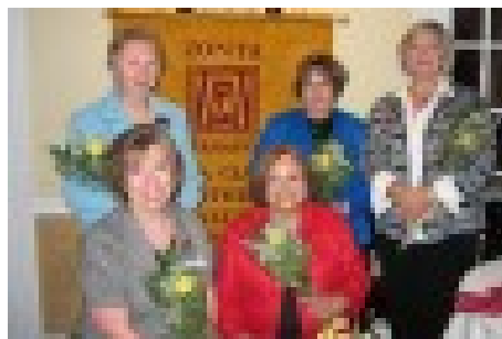
The New Board