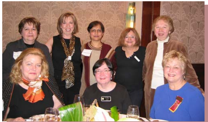
Zontians at UN Event Luncheon

The United Nations established International Women's Day in 1977 to celebrate the rights of women and international peace. However, its history stretches back to the early 1900s, when women's organizations used the day to rally support for their causes: from the universal suffrage movement to the protest of poor working conditions.